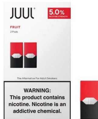
Recent JUUL Design