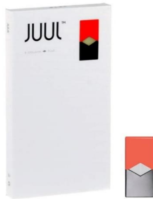
Original JUUL Design